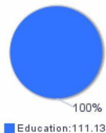
Table 1: MSYs by Focus Areas